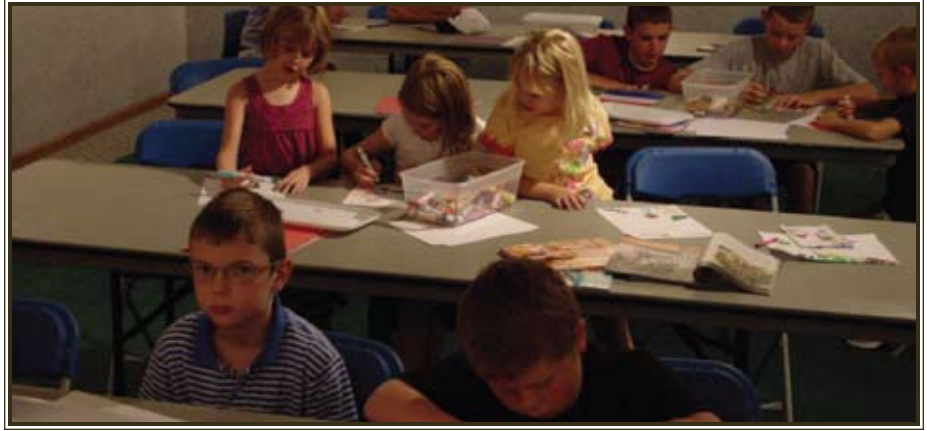
Participants at the first WC Kids Club workshop in August.

The second contest we will hold is the WC Excellence of Teaching Award. Those that can apply for this award are the administrative staff, students, or parents of a deserving teacher. The nominator will submit a creative application and supplemental statement for the teacher they are nominating. Examples are video, radio/podcast broadcast, photo essay, etc. Again, the museum will have a panel of judges who will decide the winner. The deserving teacher will