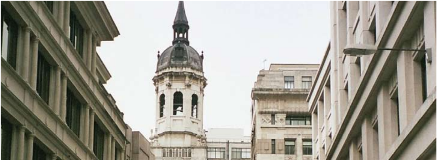
The steeple of the Church of St Magnus Martyr, featured prominently in The Wasteland , rises defiantly above newer but far less elegant buildings in the City of London

churches slated for destruction, yet has always been rescued. In essence, it remained in Eliot’s time a structure that refused to die. Yet in contrast to the “undead”—the soulless masses swarming the streets of London—the church stands as an image of rebirth and new life. Much like the symbol of the phoenix, the presence of the church reinforces the many archetypal symbols in the poem that suggest how life might emerge from death.